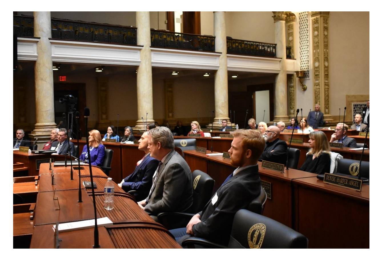
Photo Caption: KyCPA members in the Kentucky Senate Chambers, CPA Day at the Capitol 2023.

The Society is hosting CPA Day at the Kentucky Capitol this Wednesday, January 31, 2024, from 9:00-11:30 AM in Frankfort . The event provides KyCPA members with the opportunity to meet, speak with, and hear from key policymakers impacting Kentucky's business community and accounting professionals. You are welcome to register for <u>CPA Day 2024</u>, review our lineup of speakers, and spend the morning with fellow CPAs interested in impacting Kentucky's policy process.