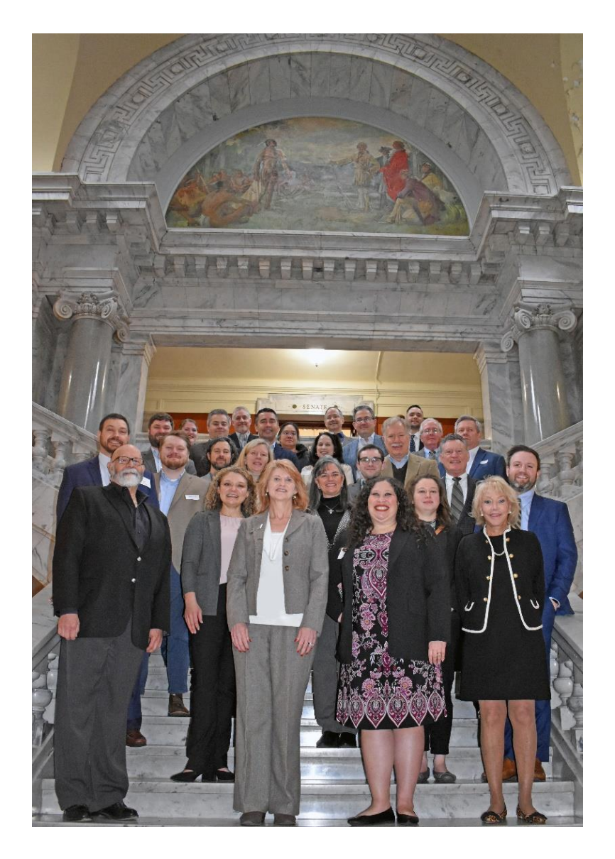
Photo Caption : KyCPA members from across the Commonwealth attend CPA Day 2024 in the Kentucky Capitol, Senate Chambers.