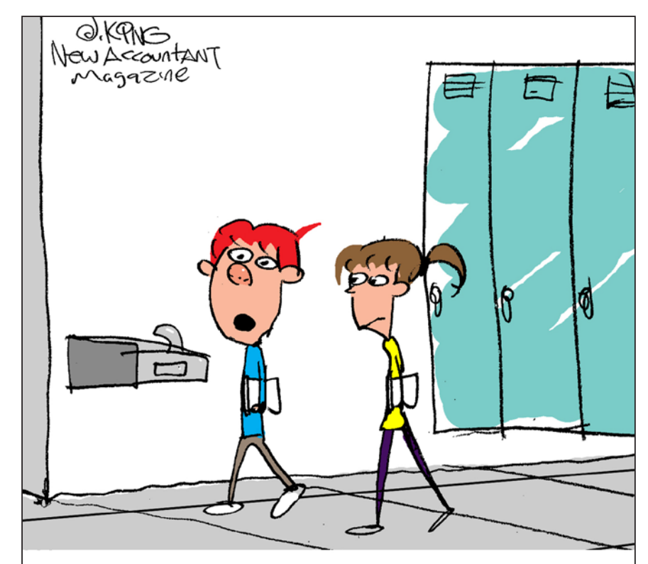
"My mom claims money doesn't grow on trees. To verify this, I've decided to be a CPA when I grow up."